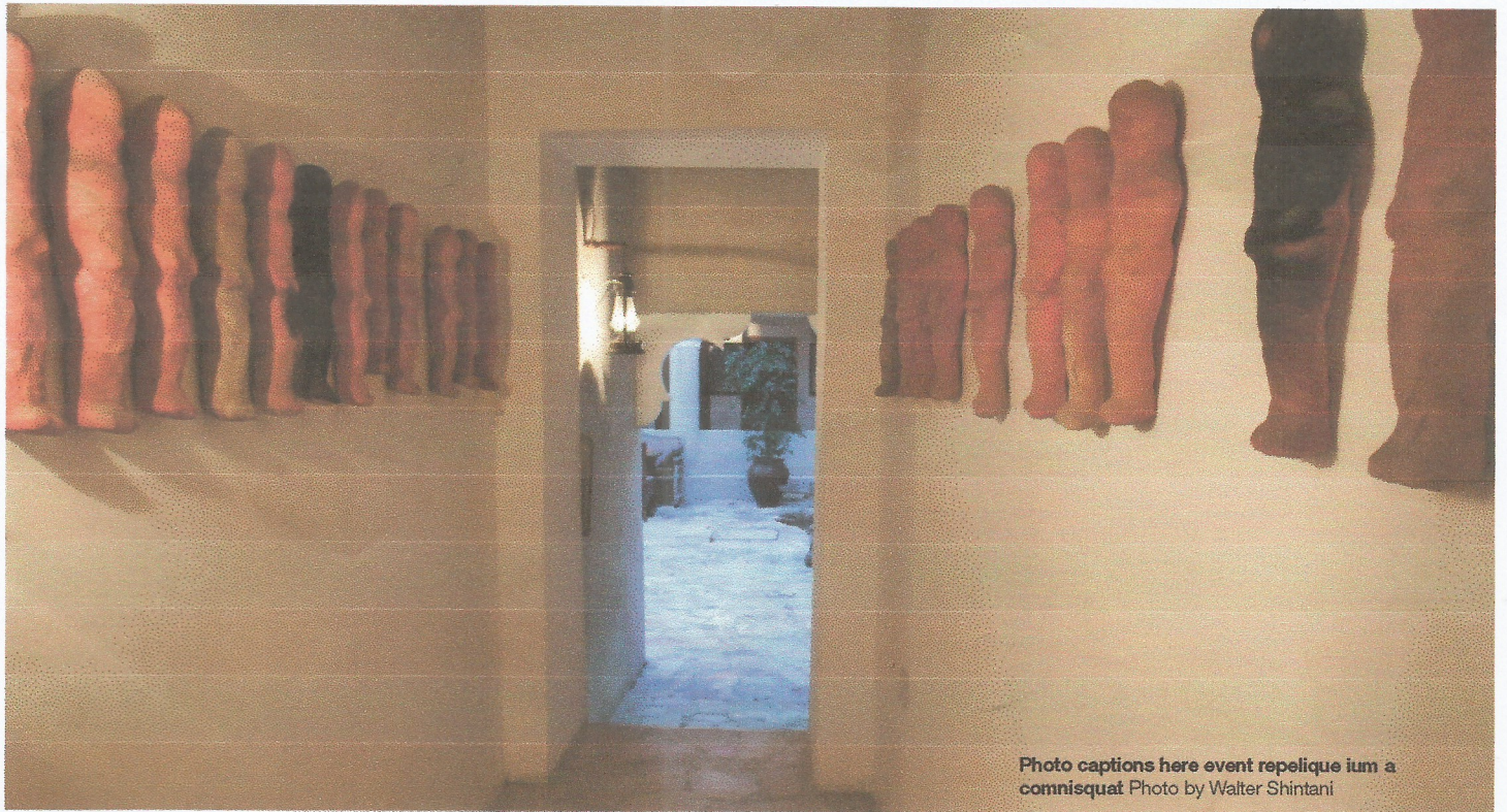
Photo captions here event repelique ium a comnisquat