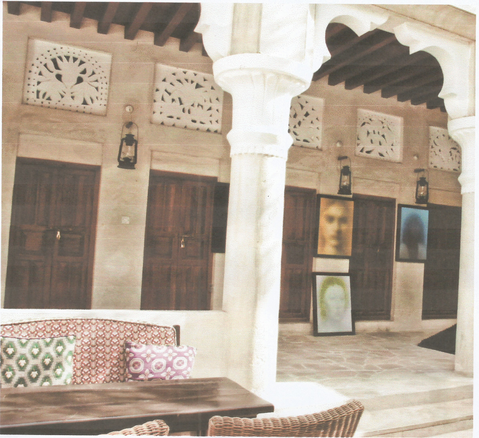
Photo captions ptaquos maximin chubazzz nusandelibus eos.