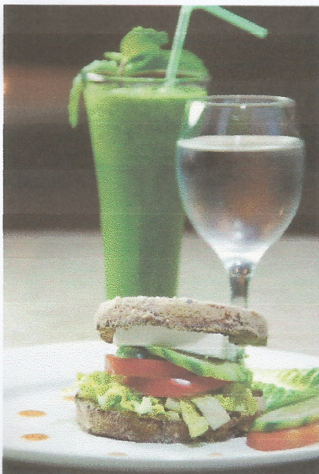
nonsed od que escillu ptaquos maximin nusandelibus eos.

room (e.g. the pillow cases, curtains, etc.). The tailor can make the same and deliver as ordered.