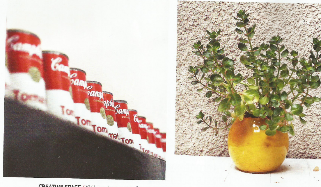
CREATIVE SPACE / XVA is a home away from home to many artists and creatives, both local and international

the city,' which was Bastikiya," she says, her voice just loud enough to be heard over the uplifting classical music emanating from the courtyard café, where several guests are enjoying their breakfast in the sunshine. "Even though there were goats walking around and it was rubble in parts, I said, "This is where I want to have my gallery, I want to